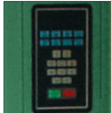
Simple programming – all wrapping parameters can be set through the control panel.