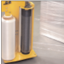
Accurate analogue gauge – eliminates the possibility of product damage.

For maximum flexibility, the Spiralgrip is programmable, with all the wrapping parameters adjustable through an easy to use digital command display with a touch-sensitive keyboard. The PRO model offers four functions, while the PRO PLUS and PRO PLUS H models offer seven adjustable wrapping functions and four programmable memories to allow for different load sizes and weights.