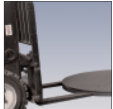
Flexibility of operation – the machine can be transferred to different areas quickly and simply by forklift.