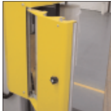
Patented easy load system – wrapping programme can be started in seconds without delay for maximum productivity.