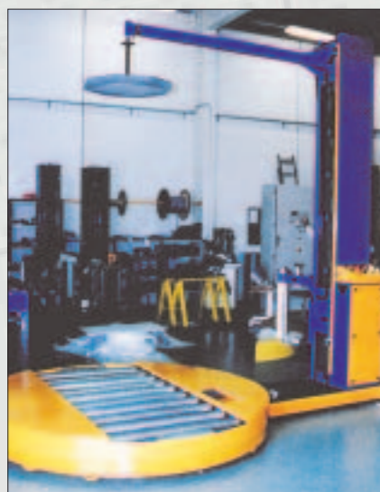
F1400 with roller conveyor and top clamp.