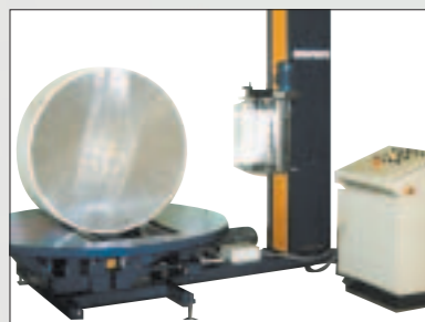
360° wrapping of paper rolls.

Ball bearing \varnothing 1050 . The large bearing ensures stability and a long life.