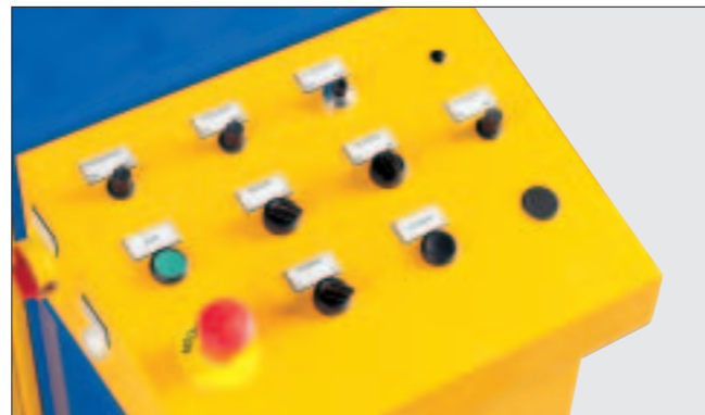
Standard operator panel