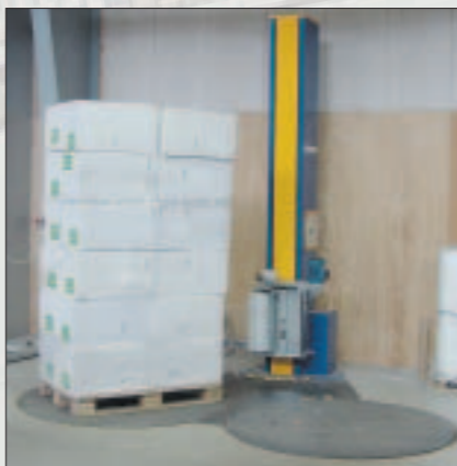
F1400 with twin turntable performance.